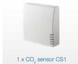
1 x CO 2 sensor CS1

The CS1 is connected to the sMove s8. With it, the CO 2 values of the room air are monitored and the ventilation intensity is automatically increased if necessary. This ensures high air quality.