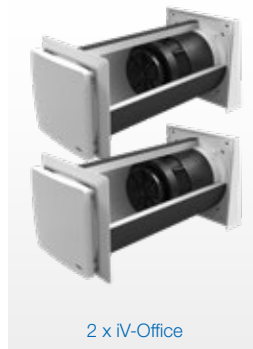
2 x iV-Office

Maximum performance with minimum noise – that's ventilation with the iV-Office. The Xenion® EFP fan with increased speed ensures healthy air exchange, e.g. in the office. Thanks to the special sound insulating material Inventin®, you can work in peace “in the fresh air”.