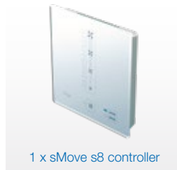
1 x sMove s8 controller

The sMove s8 controller controls the pair of iV-Office devices. He has 2 operating modes (heat recovery and ventilation) as well as a stepless setting of the ventilation intensity. Filter change indicator, pause and boost functions make operation easier.